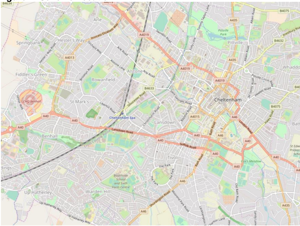
Figure 1: Scheme Location