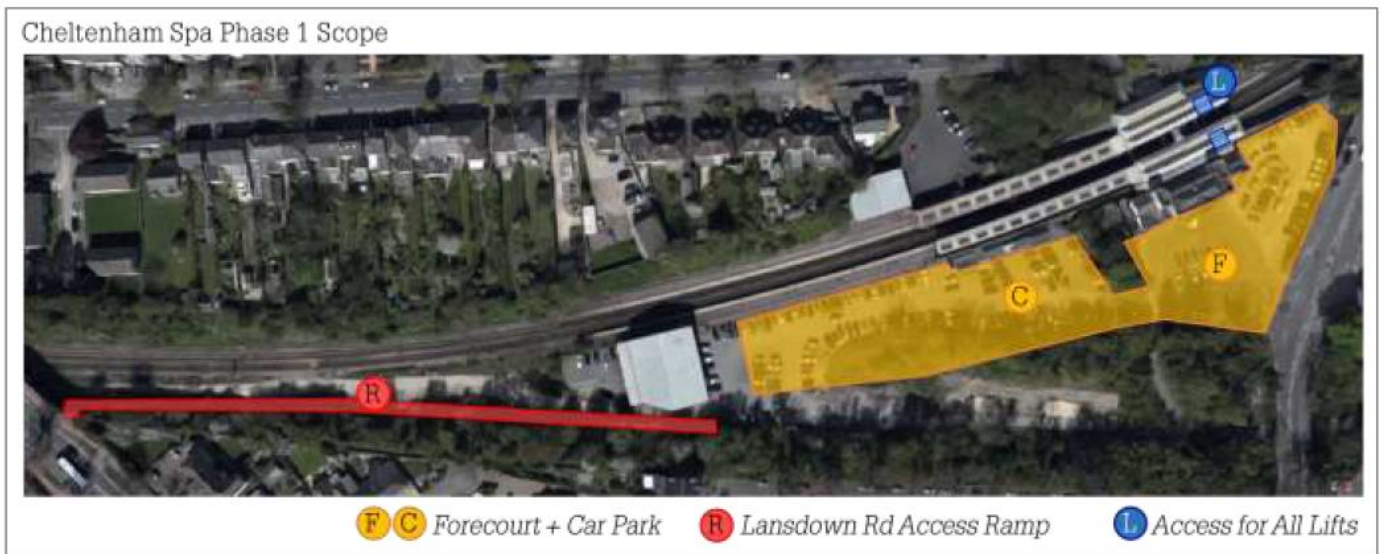
Figure 2: Scheme Elements

A single level deck car park would be constructed, using modular technology and the site topography. This will expand car park capacity by at least 70 spaces.