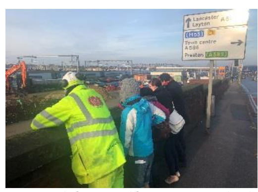
Young People from Streetlife on a site visit with Sisk

Streetlife provide a number of services for young homeless people including an emergency shelter, drop-in sessions and life skills sessions.